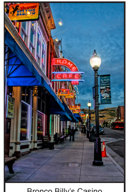
Bronco Billy's Casino

We will also have a silent auction and live auction. We do this to