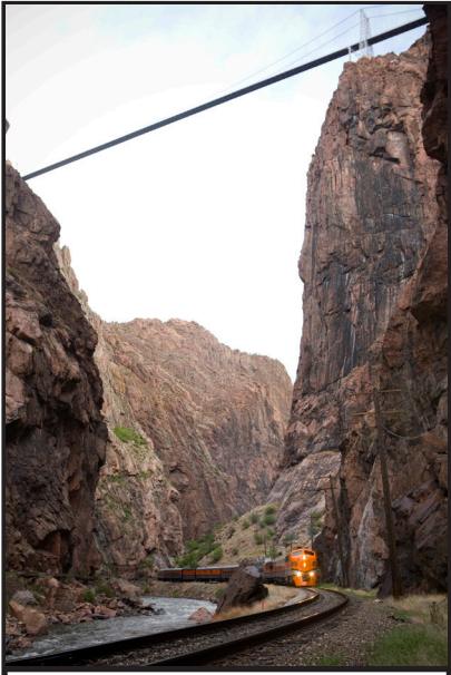
Royal Gorge Train Ride

- A one-of-kind, personal collection of everything military from WWI up to today.