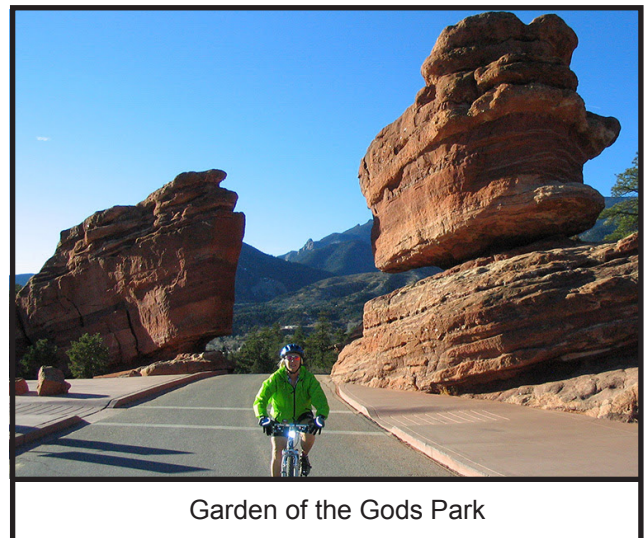
Garden of the Gods Park