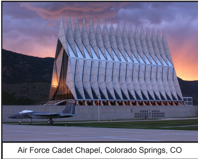
Air Force Cadet Chapel, Colorado Springs, CO